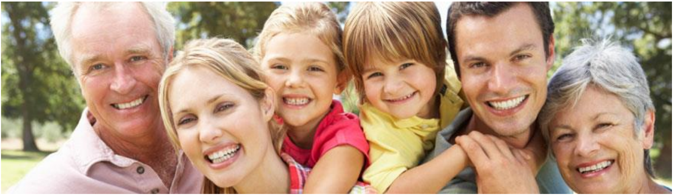
Emergency Relief 2021